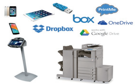
The M500 provides the easiest ways for students to access, pay and print from mobile devices and cloud accounts.