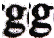
Conventional Printers VarioStream 4000

with easy connection to a wide range of inline finishing systems via industry-standard Type 1 interface.